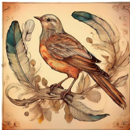
Poem by Emily Dickinson

“Hope” is the thing with feathers - That perches in the soul - And sings the tune without the words - And never stops - at all - And sweetest - in the Gale - is heard - And sore must be the storm - That could abash the little Bird That kept so many warm - I’ve heard it in the chilliest land - And on the strangest Sea - Yet - never - in Extremity, It asked a crumb - of me.